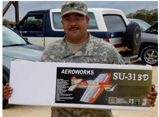
Memo's donation for the auction