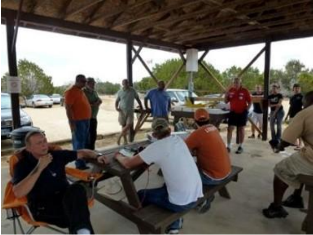
Getting ready for the Auction and the winners are: