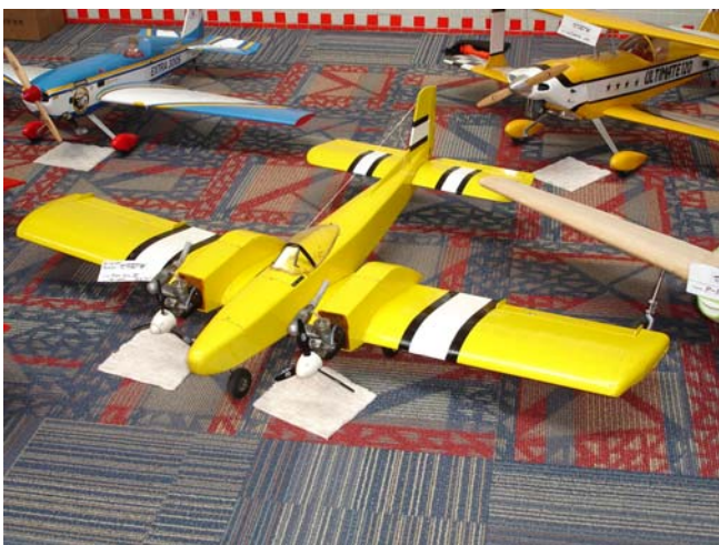
Robert Hass's Malgamation I