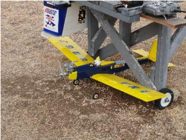
Butch Spradling's Plane