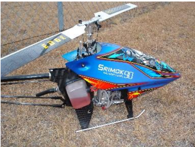
Memo's Heli and in flight below