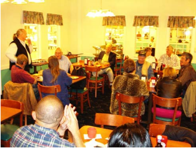
Club Members at the Party