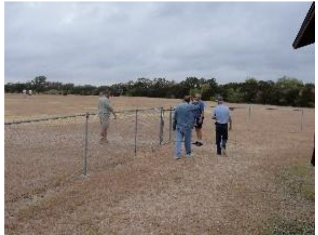
Checking out the field