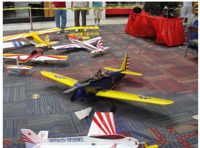
Donald Alexanders PT17