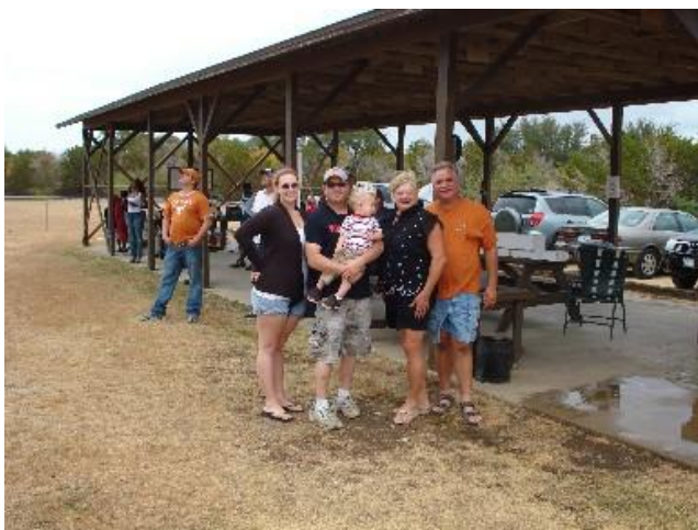
Visitor's enjoying the display of flying