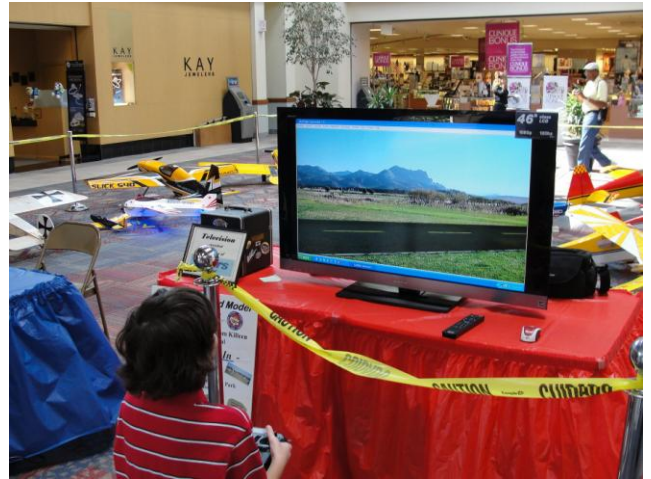
Youngster having fun with simulator