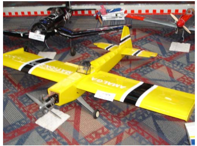
Robert Hass's Malgamation II