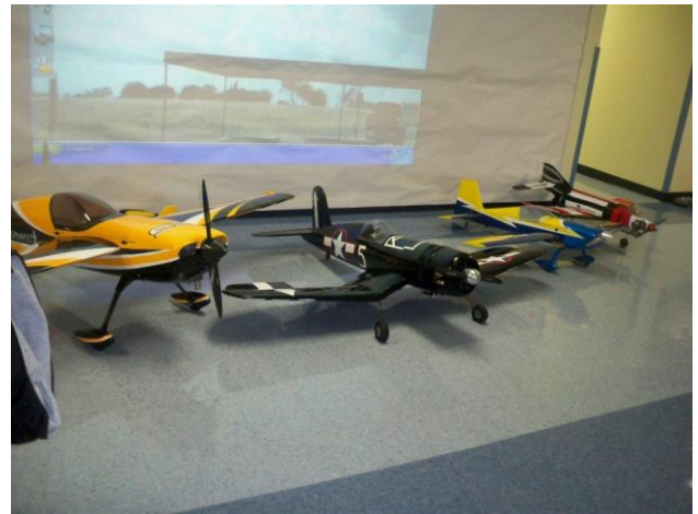
Examples on display for the Students.