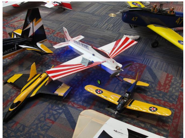
Lee Mitchell's planes on display