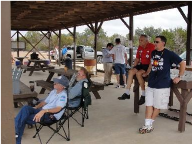
Club members enjoying the flights