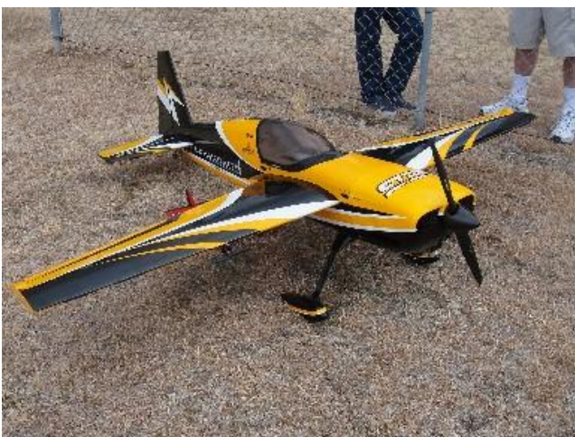
Terrance Williams's plane in flight