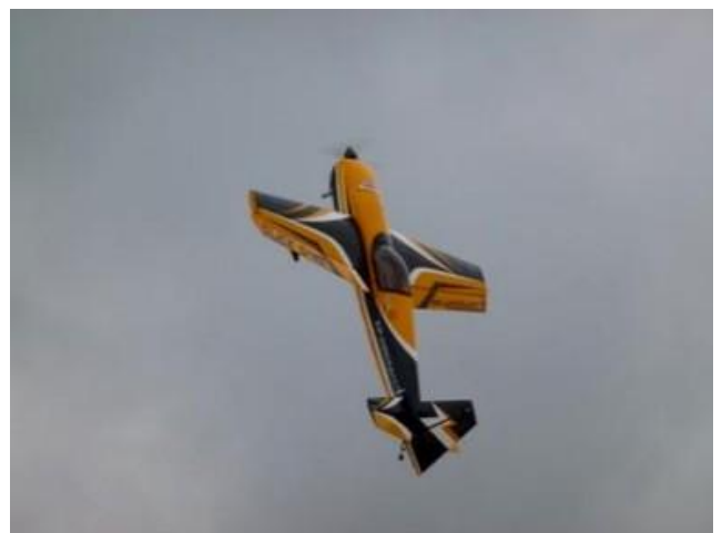
..... and in 3D